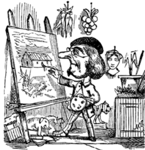
The only time I feel alive is when I'm painting.