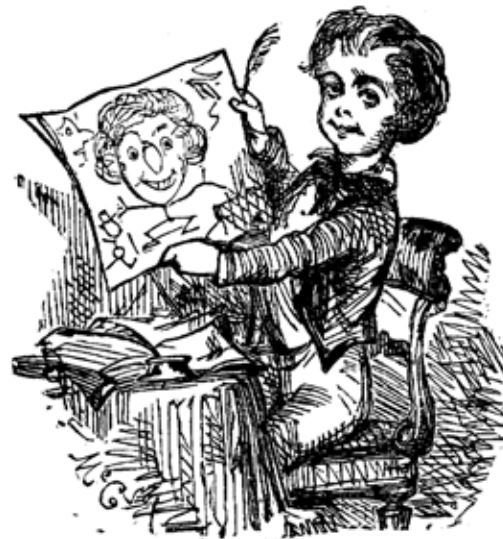
Every good painter paints what he is.