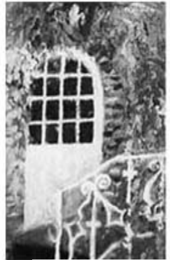
by Carly Wouters

The SSPs themselves are a very mixed bag. They include engineers, chefs, art professors and students, “corporate” artists, and even a few who are lucky enough to be able to indulge their creative passion on a full-time basis.