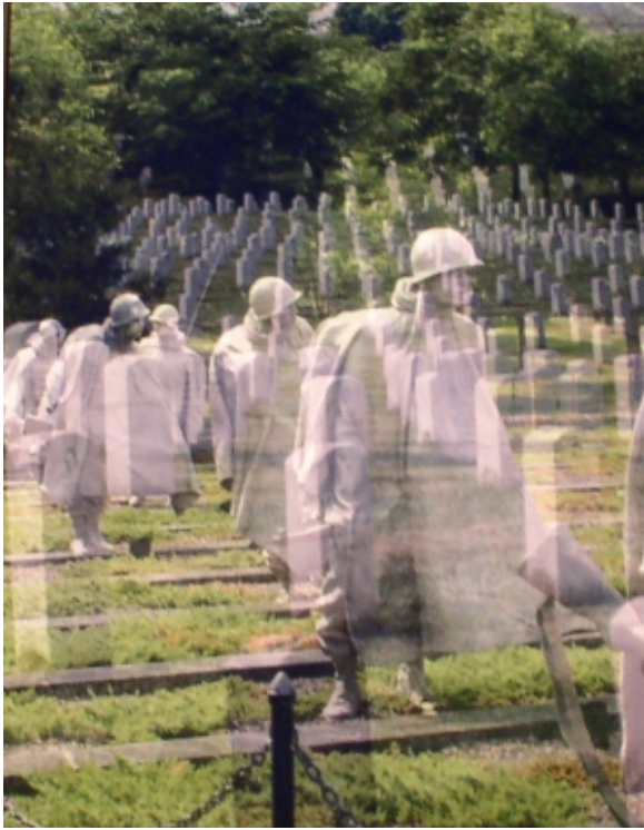
Dorothy Brunell's winning photograph "Home of the Brave"