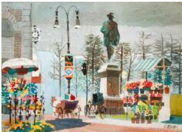
Painting by Dong Kingman

Part of the larger Regionalist art movement of the 1930s-1960s era, California Scene Painting—a term first used by