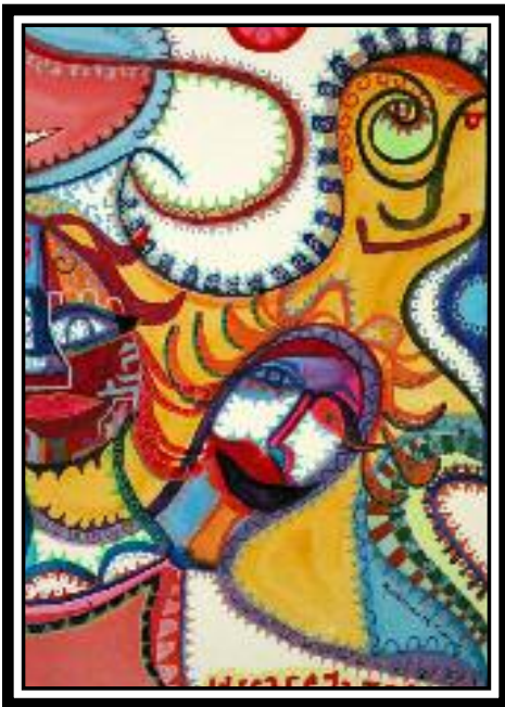
▼ 2nd Place - Kathleen McCall, Girlfriends at Music Festival, mixed media