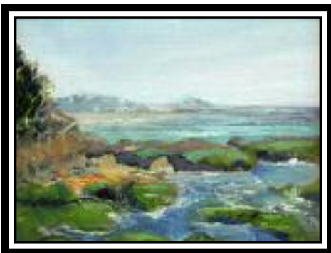
▲ Honorable Mention #1 - Veronica Kortz, Victoria Beach, oil