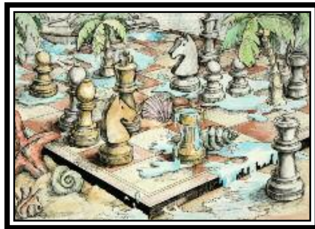
◀ 3rd Place. Y. Jung - Untitled, watercolor/ink