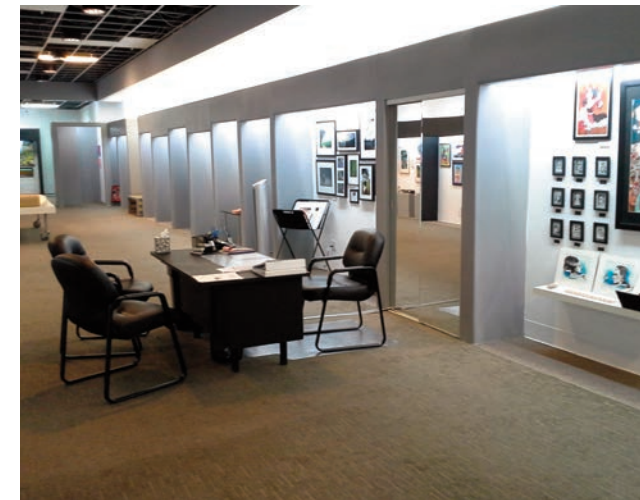
The new Gallery Soho location shown above is the 2,500 square foot space on the 2nd floor of Montclair Plaza near Nordstrom's.