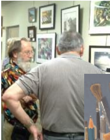
Interested opening reception attendees are shown viewing PVAA member's artwork.