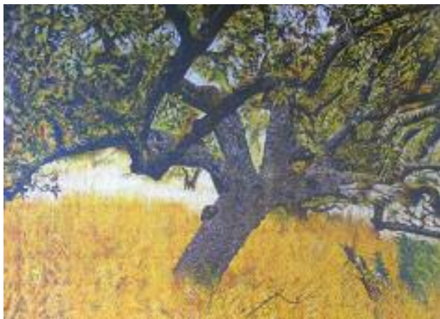
"The Oak", acrylic pointillism painting.

my first art professor in college many years ago. He made me use this technique to slow me down so that I could really see what I was drawing. Over the years I have been inspired by Seurat, Pissaro, and many of the impressionist artist to perfect my use of this technique in creating my artwork. I have expand into other