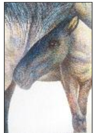
"Shy", drawn in the pointillism technique using colored artist markers, pen & ink.

The whole idea, in creating the drawing, was to capture