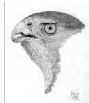
Hawk, is a pencil drawn in the stippling technique. Available as a limited edition lithographic print.

It is not unusual for me to have a pencil drawing, color marker drawing and a painting working at the same time. As a matter of fact, I often have several of both being