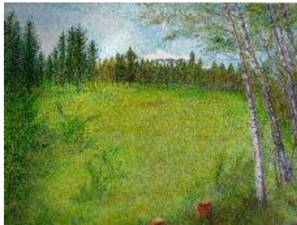
"Summer Meadow", pointillism using color artist marker, pen & ink.

I like to draw the same way I like to paint, by layering. By starting with the lightest gray scale tone and then working into the darker tones. I do not believe in using an eraser, except as a means to clean up the edges of my artwork. To me erasing remove to much of what the artist side of the brain sees.. One of my favorite methods of creating may art work is stippling and pointillism. I was introduced to this technique by