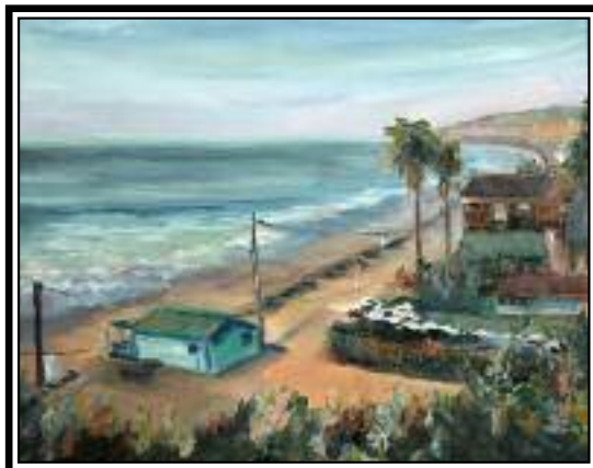
3rd Place: Veronica Kortz, Crystal Cove Restored, oil

ARTWORK DISPLAYED IN FULL-COLOR ON WEBSITE AT WWW.PVAA.NET