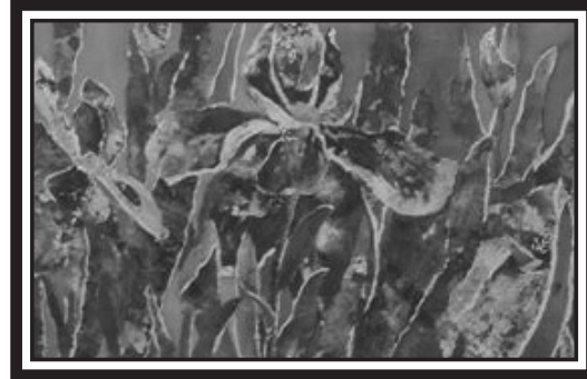
2nd place - Michi Ikeda for her water- color collage titled "Once Again"