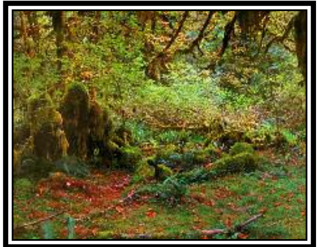
▶ 2nd Place: Jerius Williams, Twilight Forest, Photograph