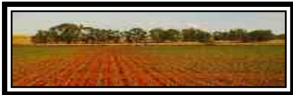
HM: Jerius Williams, Photography, "Fields of Gold"