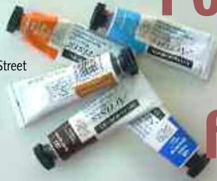
Exhibit Opportunity For PVAA Artists at Upland Thursday Nites

The Upland Market and Artwalk provides an exhibit and sales opportunity for PVAA members. This is on Thursday nights during the Spring and Summer (5-9 pm) in downtown Upland. The specific need exists to provide information, brochures and membership applications to passers by (potential members) at the PVAA booth. Artists wishing to set up and work the booth are welcome to display and sell their own work as well.