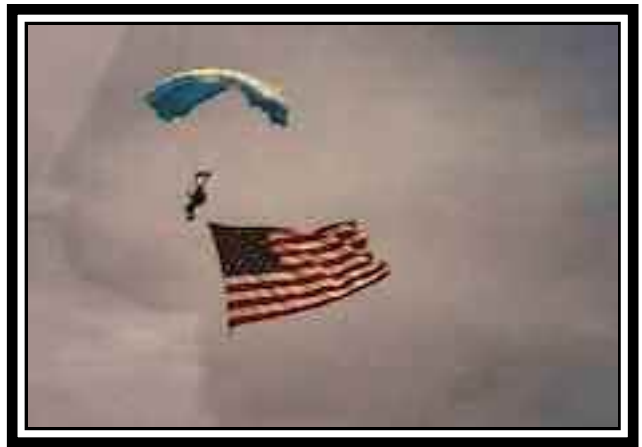
1st Place: Arlene Moreno, Photography, "San Dimas Pride"