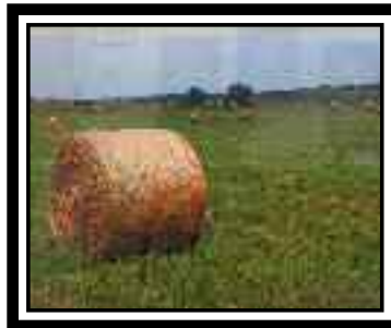
HM: Jerius Williams, Photography, "Harvest"