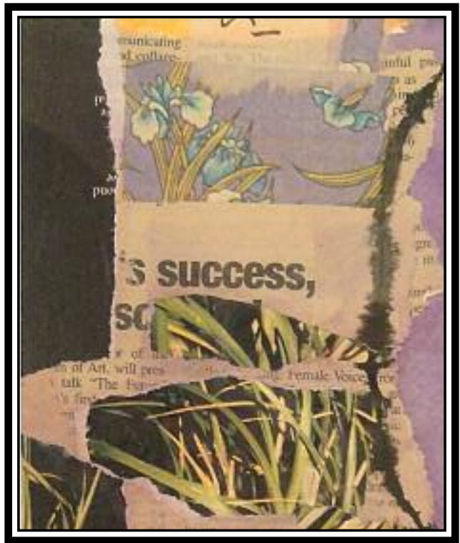
▶ 1st Place: Gurutej Khalsa, Mix media, untitled