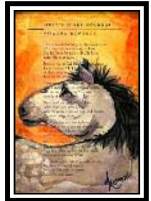
▲ HM 2: Arlene Moreno, Collage,