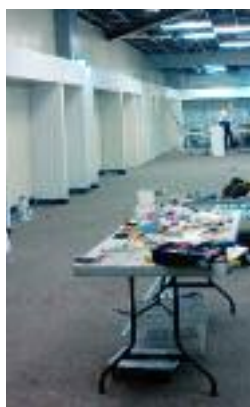
There a lot of dedicated members that have been working very hard to make the gallery ready for artists.