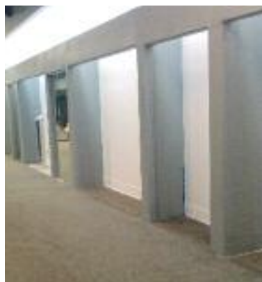
Shown above is a view of the finished cubicles or artist's alcoves that will provide a private space (seemingly quite desirable) for each exhibitor's displayed artwork.