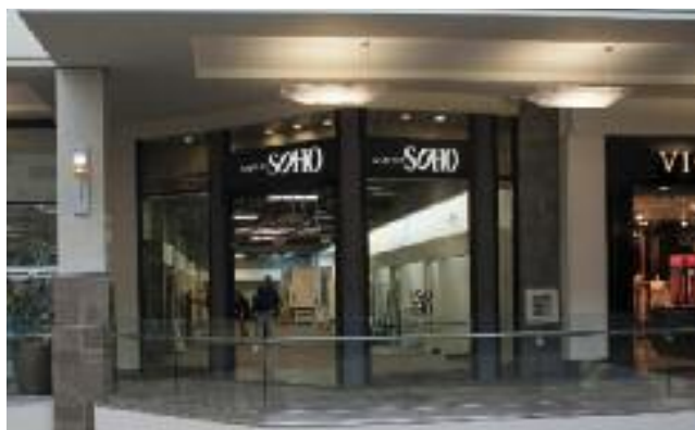
The new Gallery Soho location shown above is the 2,000 square foot space on the 2nd floor of Montclair Plaza near Nordstrom's.