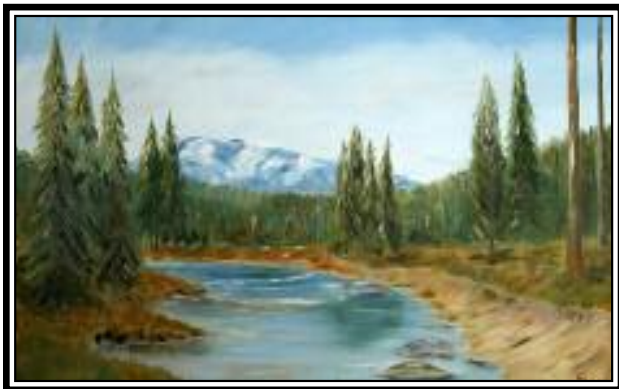
3rd Place - Sven Forslund, Riverbend, oil