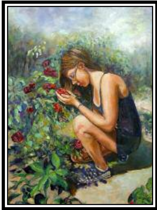
2nd - Veronica Kartz, Beauty Beholding Beauty, oil