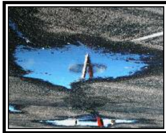
3rd - Eyton Miller, Eternal Spring Hope , digital