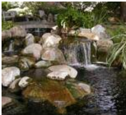
The beautiful Maranatha High School Campus is the location of this years event.

Registration forms are to be returned to: MVAL, 1618 Laurel Street, South Pasadena, CA 91030.